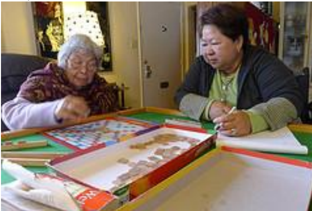
Domestic Care Worker providing crucial care work in the resident's home.

includes domestic workers and personal attendants. The burden is on the employer to provide documentation and pay schedules. The Attorney General's Office provides explicit requirements for the employer to adhere to as a preventative strategy, with enforcement options including civil penalties. 74