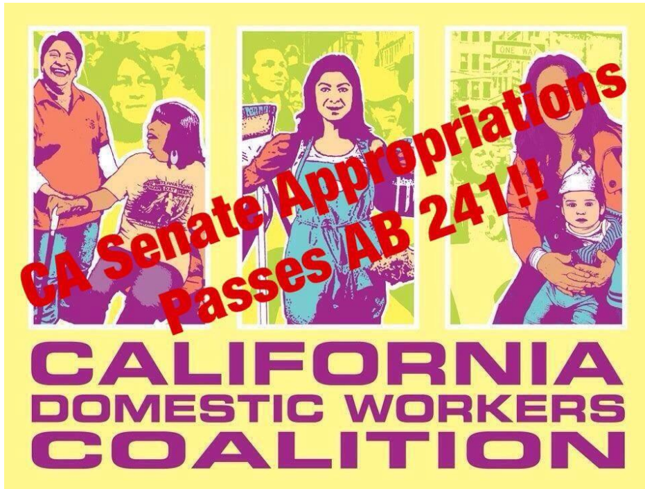
Caption: Campaign poster from California Domestic Workers Coalition, September 2013. Credit: California Domestic Workers Coalition