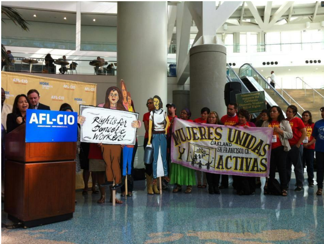
Domestic Workers and AFL-CIO hold a press conference celebrating lobbying and success of AB 241 at the California Legislature in Sacramento, CA October 12, 2013.